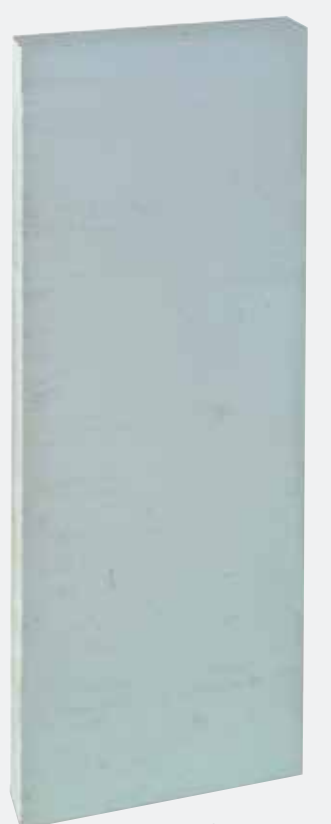
Celcon Vertical Wall Panels